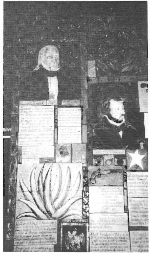
James K. Polk and John C. Frémont