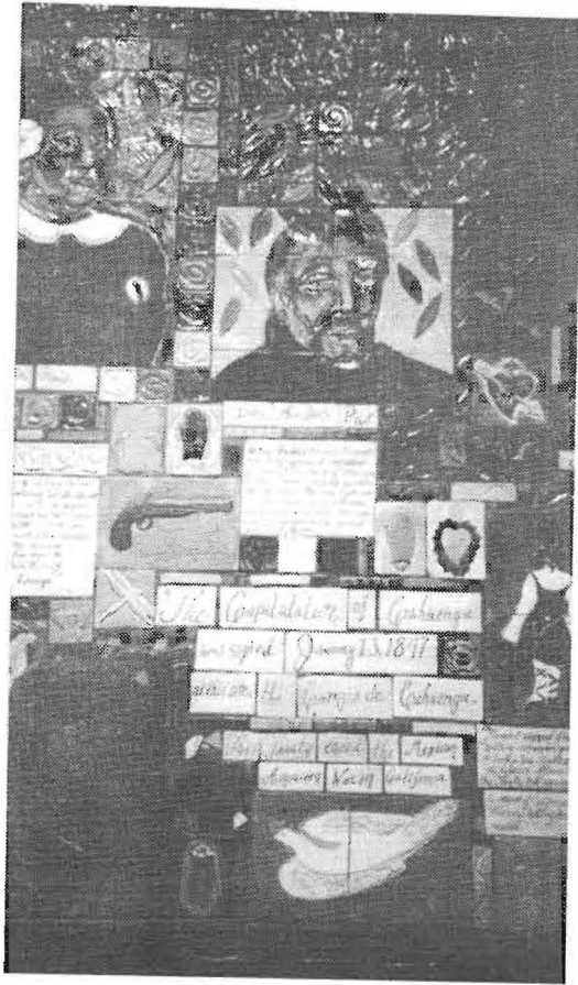
Don Andrés Pico