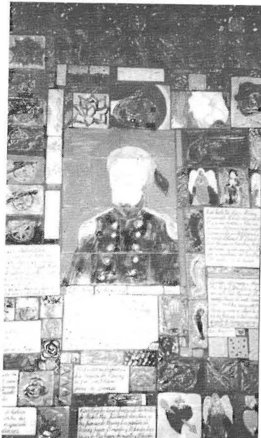
Stephen Watts Kearny