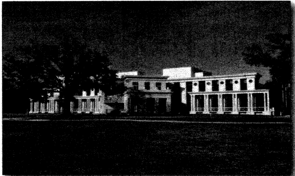
Jefferson Davis Presidential Library