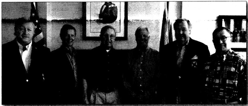
Beauvoir • May 2013 • Biloxi, Mississippi